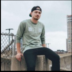
MINNEAPOLIS/ST PAUL, MN